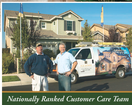
Nationally Ranked Customer Care Team

The extended Federal Tax Credit is available for 10% of the purchase price up to $8,000* for qualified