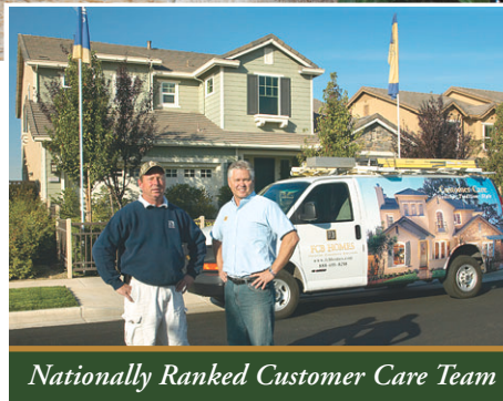
Nationally Ranked Customer Care Team

A $10,000* California State Tax Credit was available for residents that purchased a new home by March 1,